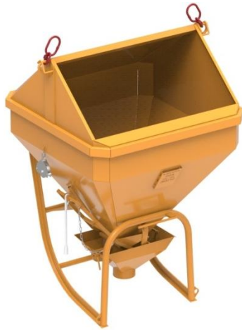
TIC PF 1500 L