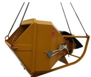
Horizontal handling when empty to ease the loading and the unloading on the trucks

Presentation: This column skip is designed to enable concrete to be poured into narrow shuttering or columns. It is a rollover type skip whereby the skip sits in the horizontal position for filling and reverts to the vertical when in use.