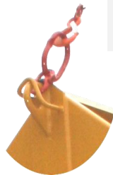
Zoom on a lifting point (European patent)